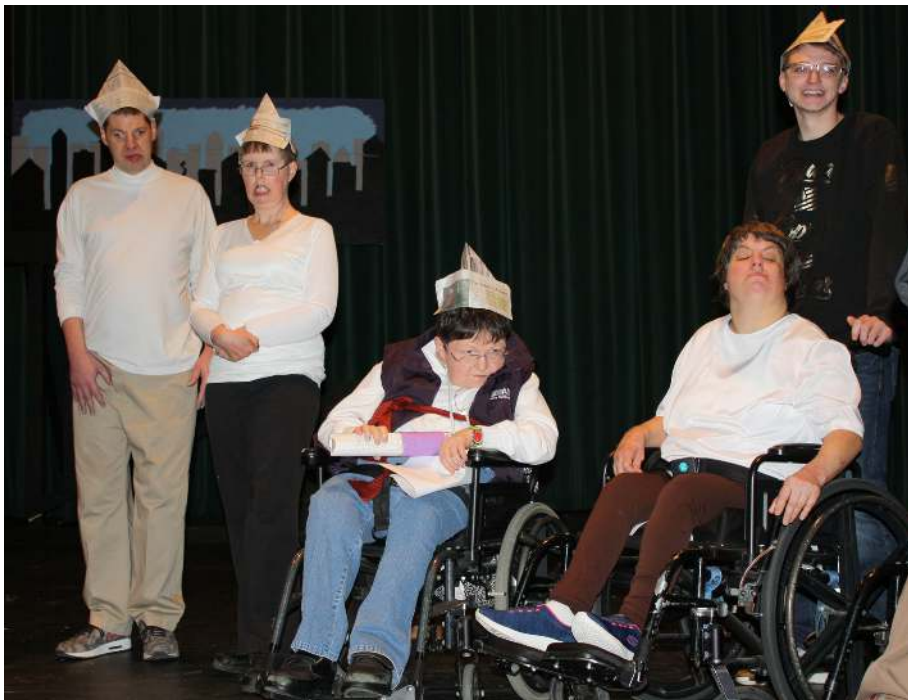
Above: People from Lancer/Houston perform "A Pirate's Life for Me" during ABLE Idol.

Congratulations to everyone for a great show!