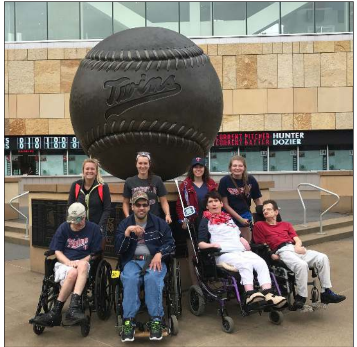
A group from Lancer takes in a Twins game during the Memorial Day weekend.

Meanwhile, a group from Lancer attended a Twins baseball game at Target Field over the Memorial Day weekend. It was the second group from Lancer to make a trip to a Twins' game so far this season.